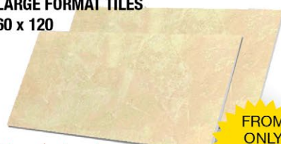
LARGE FORMAT TILES 60 x 120